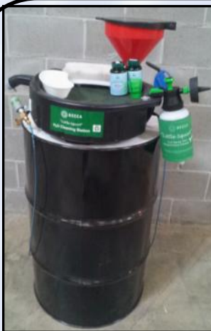
"Clean to Waste" System