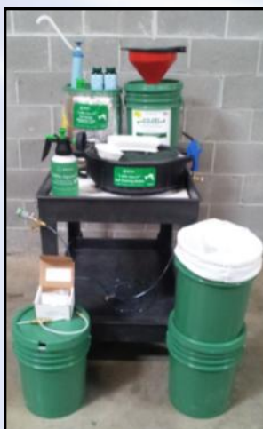
"Clean & Recycle" System

Little Squirt, Cleaning Station, Air Kit, Standard HEAT Tank System w/ Hand Pump, Clarifier Recycling System, H2O Dry Kit, & H2O Dry Funnel